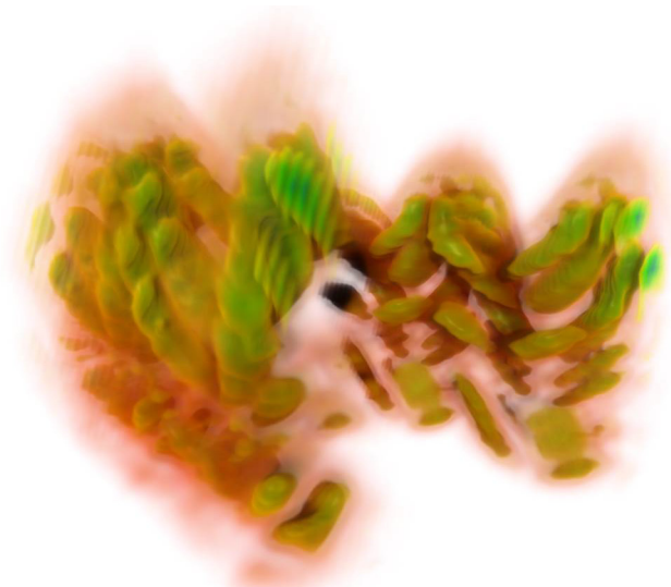
Sergej Stoppel and Erlend Hodneland

MedViz wishes to use scientific pictures to profile our activity. This is because all our activities are based on images, image information and its utilization for improved diagnoses resulting in better patient treatment. Previously awarded images are shown below.